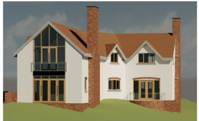
3D Render 1