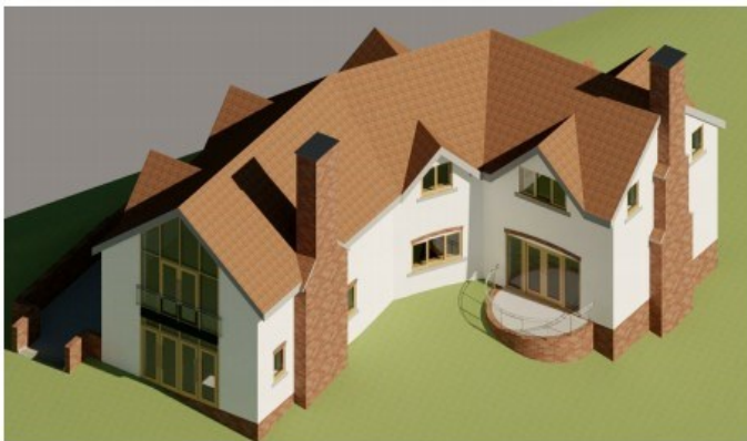
3D High Level View 2