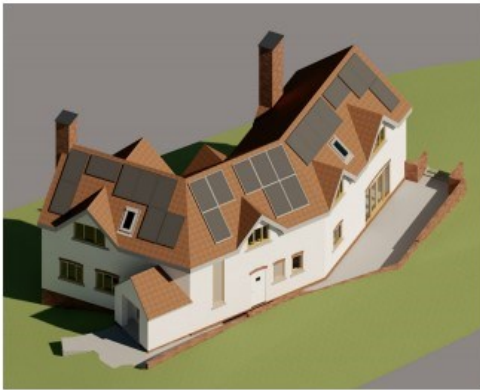
3D High Level View 1