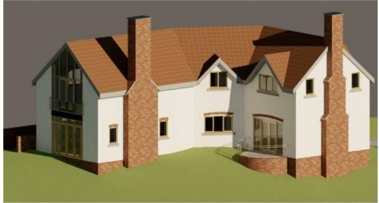
3D North View